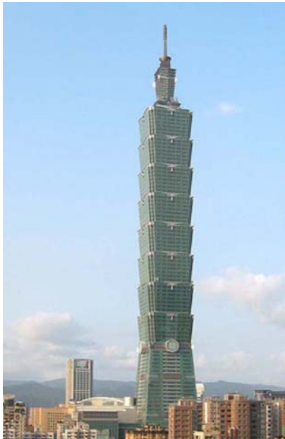
Taiwan Power Company - HDCS Project